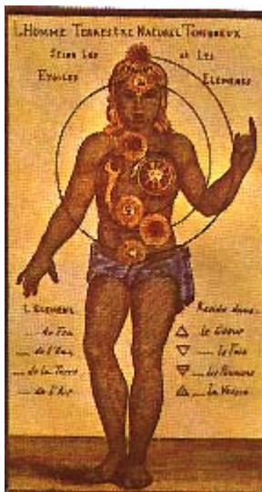
Illustration from "Theosophica Practica" by 17th century mystic Johann Georg Gichtel, showing seven chakras

The magical mystery religion of ancient Egypt, being the oldest civilisation one had any knowledge of, exercised a great fascination over the Renaissance men. The mysterious hieroglyphs were considered to be symbols of hidden knowledge revealed by God to men that could not be passed on in words. Symbols and gestures became means of conveying truths and values. The cosmos was seen as an organic unity. It was peopled by a hierarchy of spirits which exercised all kinds of influences and sympathies. The practice of magic became a holy quest, a search for knowledge, not through the intellect, but by revelation to the pure in mind.