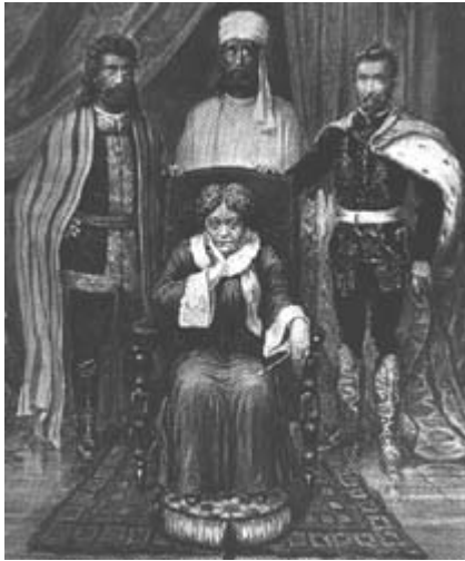
H.P. Blavatsky and her masters Morya, Koot Hoomi and Prince Ragoczy

Thus she presented a remarkable and revolutionary concept of life in the universe. At the same time she gave man a new purpose of living based on Indian religious and philosophical traditions.