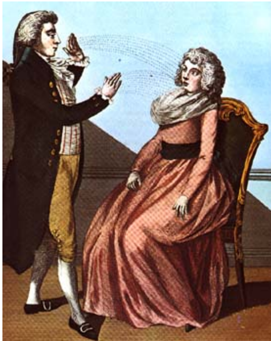
Mesmer hypnotizes somnabule

Towards the end of the eighteenth century new scientific discoveries and inventions had captured the public's mind. Specifically experiments with electricity gave fuel to the most amazing and weird theories involving fluidum, ether or phlogiston to explain its wonderful properties. It is nowadays generally hushed up that the great minds of that era, like Newton, believed in heretical notions that would nowadays relegate a scientist to oblivion by the academic community.