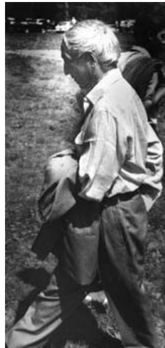
Krishnamurti, Saanen 1967

Jiddu's gift was discovered by Annie Besant's closest colleague C.W. Leadbeater in 1909. To her dismay after reaching maturity he became to advocate quite a different approach to life than Theosophists did. His disbanding in 1929 the Order of the Star in the East , especially founded for him, came as a blow to the Theosophical Movement. It had already been plagued by split-ups. Theosophy became after the thirties a shadow of the former mind-swaying movement. Its role was taken over by others.